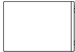
3 SIDE ELEVATION